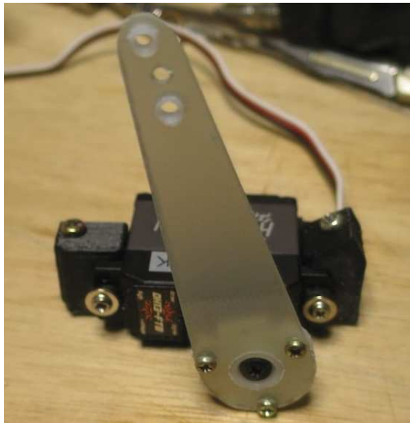
Figure 8: Sail servo with arm

Effective servo arm length 45 mm is sufficient at 180° travel. Hyperion DH13 FMB or FTB is recommended for its high torque, light weight, HV capability and programmable travel.