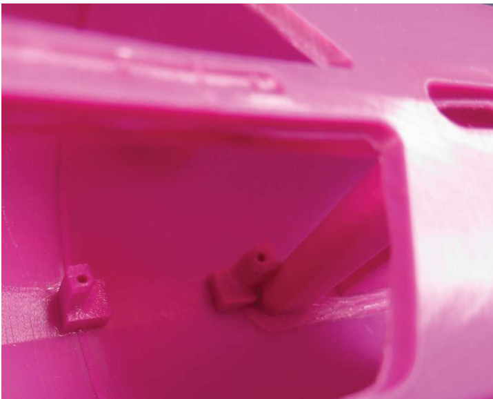
Figure 9: Sail servo mounts

Effective servo arm length 45 mm is sufficient at 180° travel. Hyperion DH13 FMB or FTB is recommended for its high torque, light weight, HV capability and programmable travel.